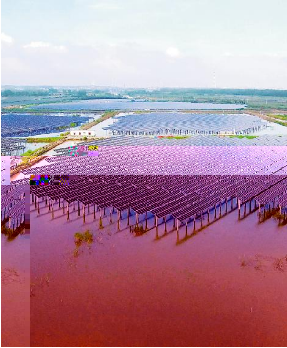
# $b > d' @AF G